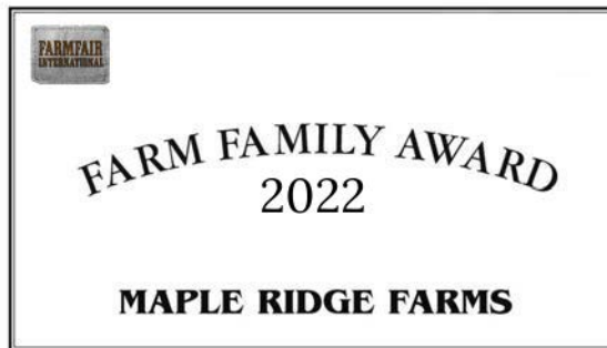
Example Gate Sign: FARM NAME

PLEASE PRINT GATE SIGN NAME AS IT WILL APPEAR ON THE SIGN: